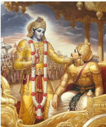
Krishna and Arjuna

So how do we remove these samskaras and reach final absorption into the Godhead? If we search all the Hindu Vedas , the Upanishads , and the Yoga Sutras , we find many ceremonies and types of yoga designed to release us from the wheel of death and rebirth. However, what is the simplest answer?